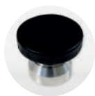
INTERNAL WRIST REST