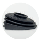
ADJUSTABLE MICROSCOPE STAND (5° - 25°)