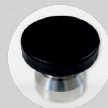
INTERNAL WRIST REST