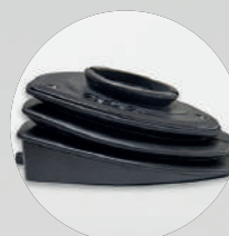
ADJUSTABLE MICROSCOPE STAND (5° - 25°)